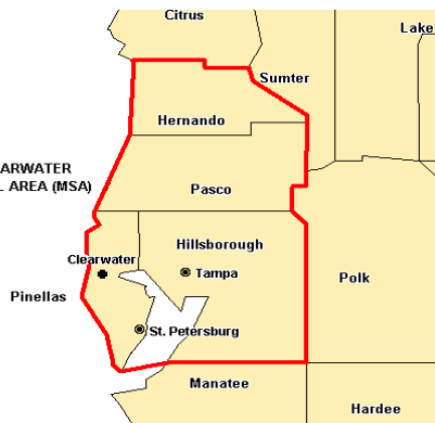
TAMPA-ST PETERSBURG-CLEARWATER METROPOLITAN STATISTICAL AREA (MSA)